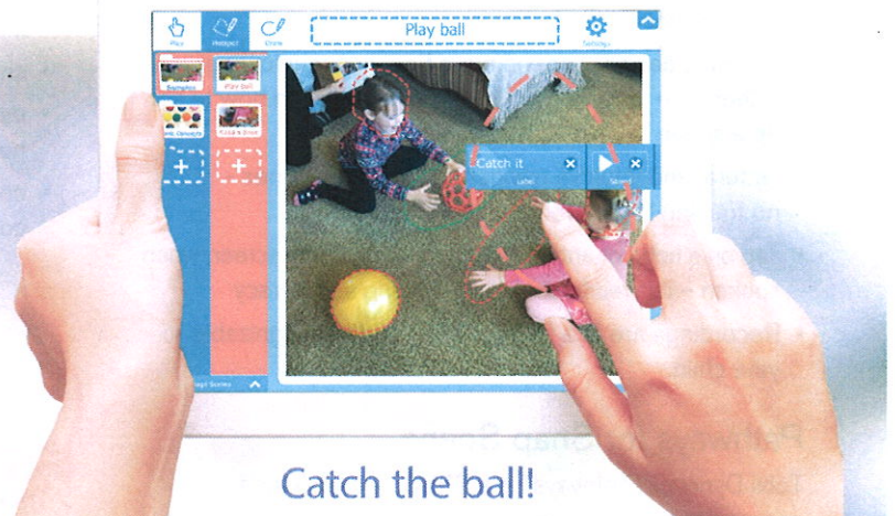
Catch the ball!

An instant scene-based communication and language learning app for your child.